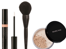
Perfecting Set $54