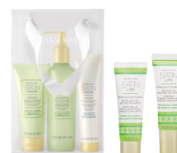
Satin Set $64