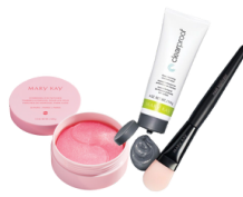
Detox & Destress $82