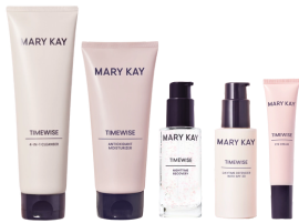
TW Ultimate Miracle Set $150