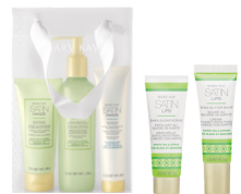
Satin Set $64