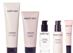
TW Ultimate Miracle Set $150