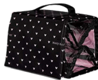
Travel Roll Up Bag (unfilled) $40