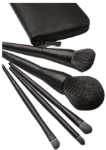
Brush Collection | $60