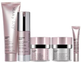
Repair Set $215