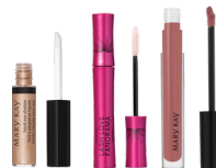
Dash Out the Door $50