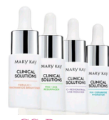
CS Booster $38 each