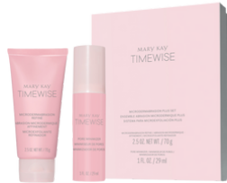
Microdermabrasion Plus Set $58