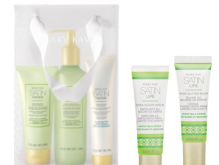
Satin Set $64