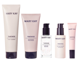
TW Ultimate Miracle Set $150