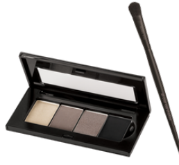
Petite Color Set | $54