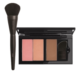
Contour Set | $80