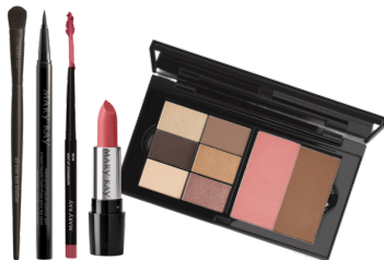
Glam Girl Set | $160