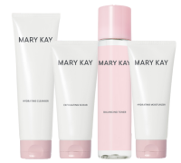
MK Skin Care Line $80