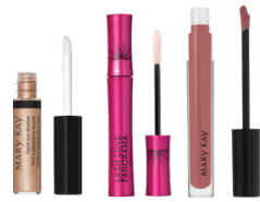
Dash Out the Door $50