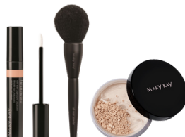
Perfecting Set $54