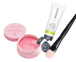
Detox & Destress $82