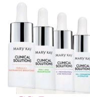
CS Booster $38 each