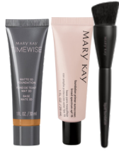
Base-ics Set | $60