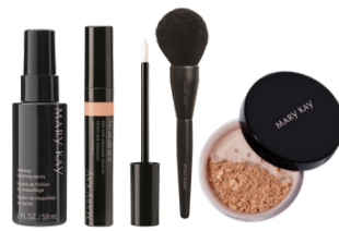
Flawless Finish Set | $74