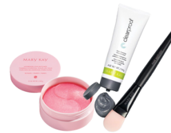
Detox & Destress $82