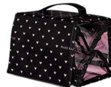
Travel Roll Up Bag (unfilled) $40