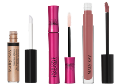
Dash Out the Door $50