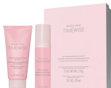
Microdermabrasion Plus Set $58