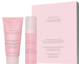
Microdermabrasion Plus Set $58