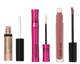
Dash of Color Set | $50