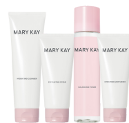
MK Skin Care Line $80