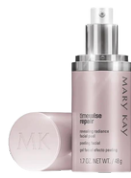
Facial Peel $68