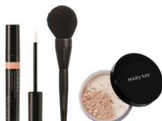
Perfecting Set $54