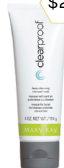
Deep Cleansing Charcoal Mask