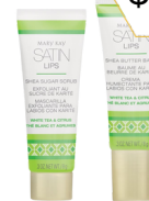
Satin Lips Set