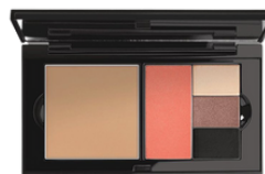
Perfect Palette (unfilled)