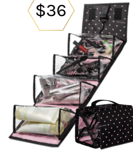
Travel Roll Up Bag