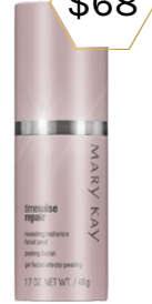
Revealing Radiance Facial Peel