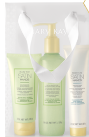
Satin Hands Set