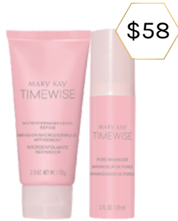
Microdermabrasion Plus Set