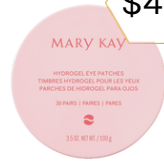
Hydrogel Eye Patches