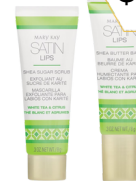
Satin Lips Set