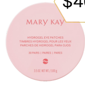
Hydrogel Eye Patches